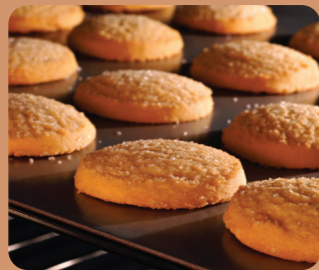
BISCUITS / COOKIES